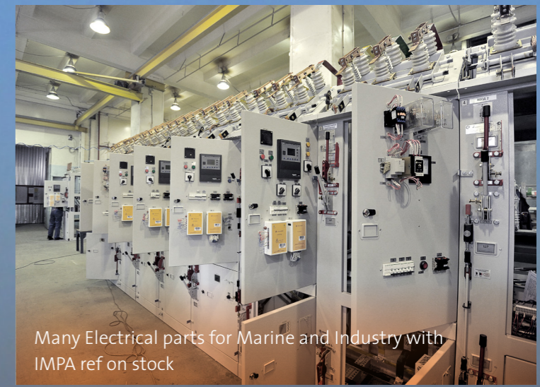
Many Electrical parts for Marine and Industry with IMPA ref on stock